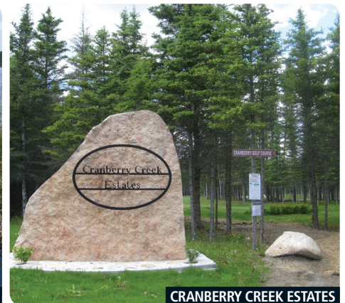
CRANBERRY CREEK ESTATES

These properties will be sold as six (6) lots on June 24, 2013 at unreserved public auction at the Saskatoon Auction site. Each lot will be sold to the highest bidder on auction day, regardless of price.