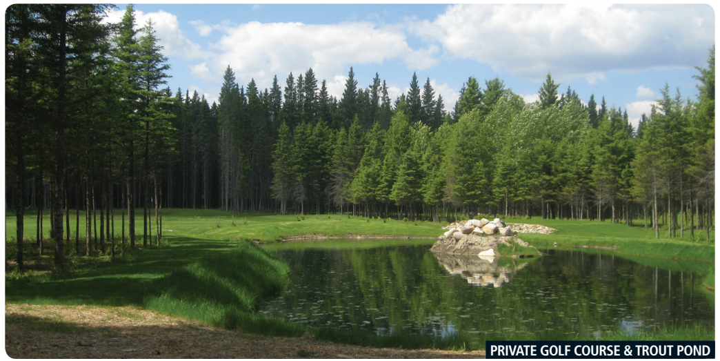
PRIVATE GOLF COURSE & TROUT POND

Selling at the Saskatoon Auction Site Hwy 12 & Cory Road – Each lot will be sold to the highest bidder regardless of price.